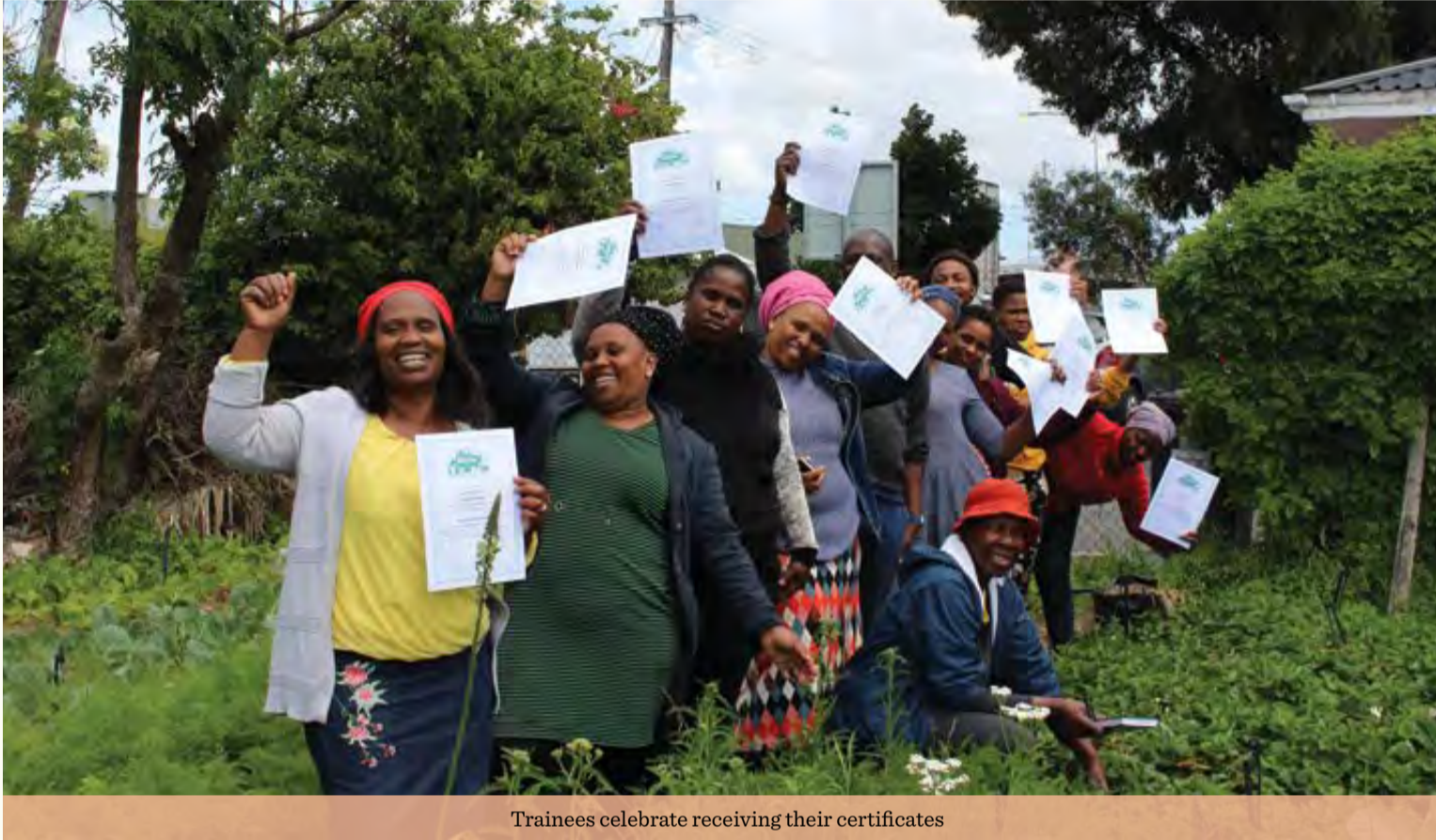
Trainees celebrate receiving their certificates

Head office: 1 Boston Circle, Airport Industria North, Cape Town PO Box 44, Observatory, 7935 ☎ 021 3711653 ✉ info@abalimi.org.za