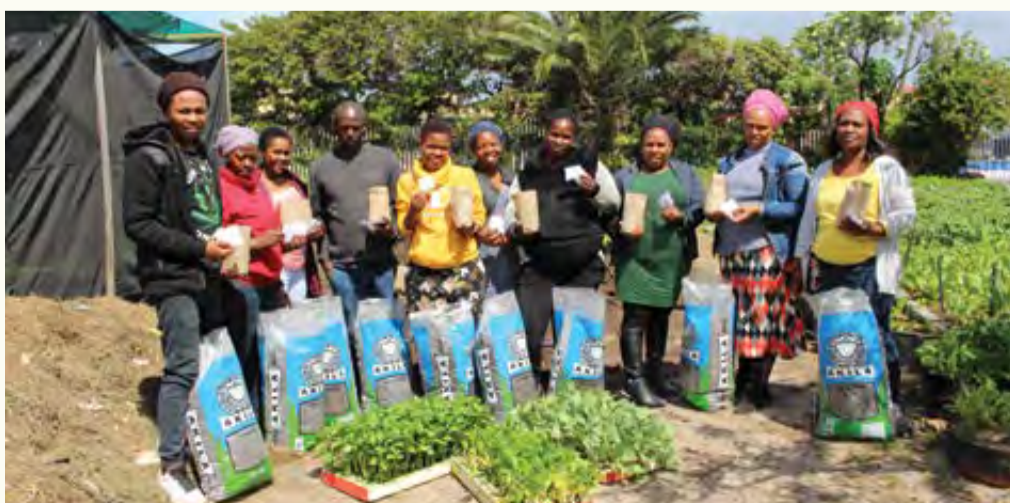
Trainees receive their garden starter packs

Abalimi Garden Centres provide low cost seeds, seedlings and manure